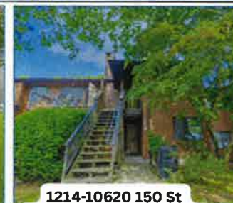
1214-10620 150 St 2 Bed Townhouse Asking $549k