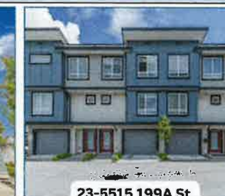
23-5515 199A St. 3 Bed Townhouse Asking $849k

TOP 1% Team of ALL FRASER VALLEY REALTORS*