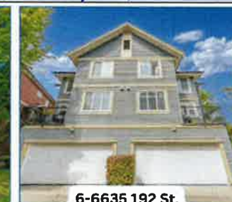
6-6635 192 St. 4 Bed Townhouse Asking $899k