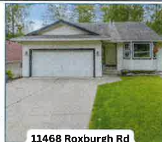
11468 Roxburgh Rd 5 Bed House w/ Mortgage Helper Asking $1.375M